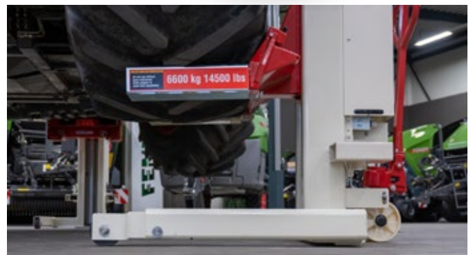
Base Frame and Lifting Fork Extensions for extra wide tyre sizes.