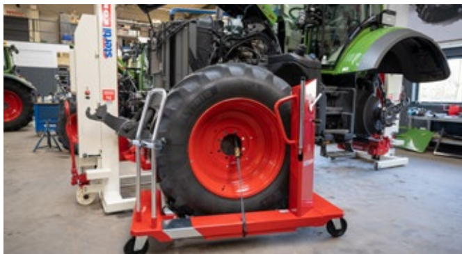
Wheel Dolly for convenient and ergonomic removal of large wheels.