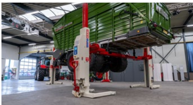
Low-profile Crossbeam for easy-access wheel-free maintenance.