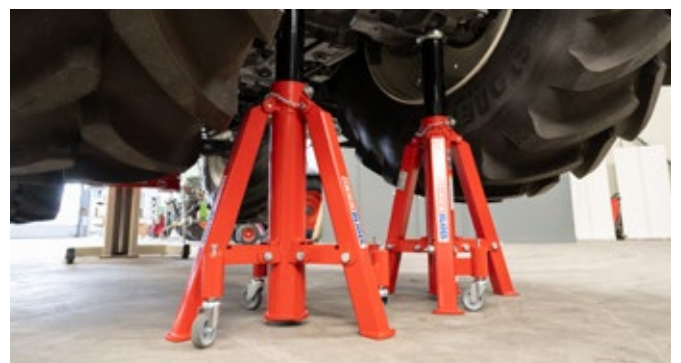
Axle Stands in various heights for extra support.