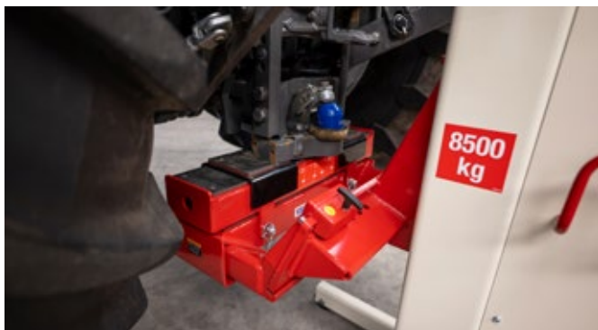
Multi-purpose adapters for wheel-free front or rear vehicle lifting with two mobile column lifts.